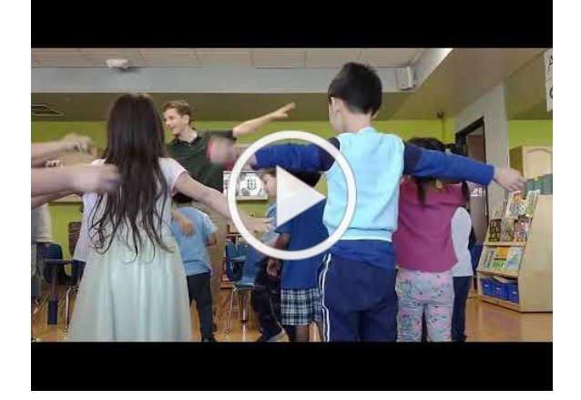
The joy and power of music in early education is undeniable, and we can't wait to hear it live in our centers. Welcome, Golden Acorn!