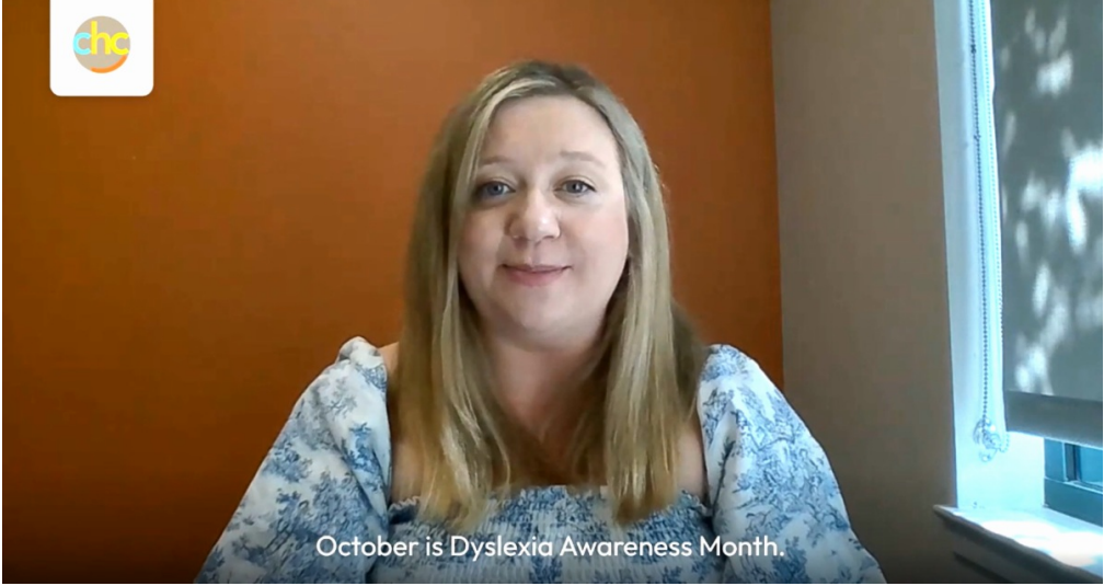
October is Dyslexia Awareness Month.